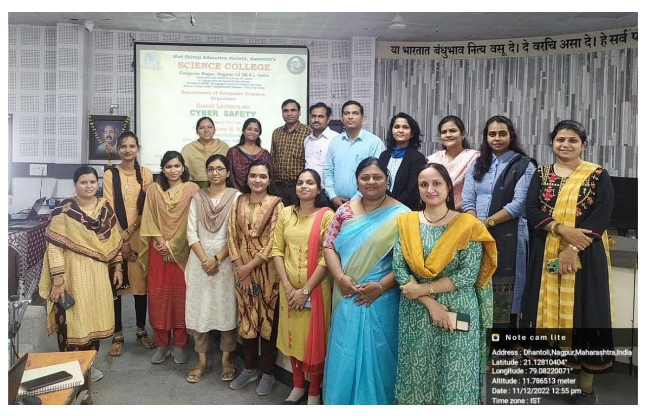
Group Photo: Staff Members of Computer Science Department with Guest Speaker