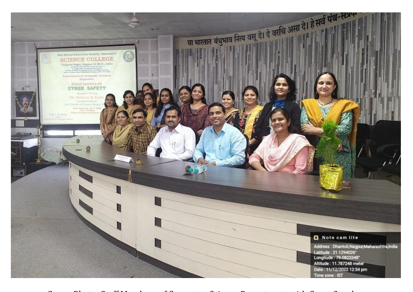
Group Photo: Staff Members of Computer Science Department with Guest Speaker