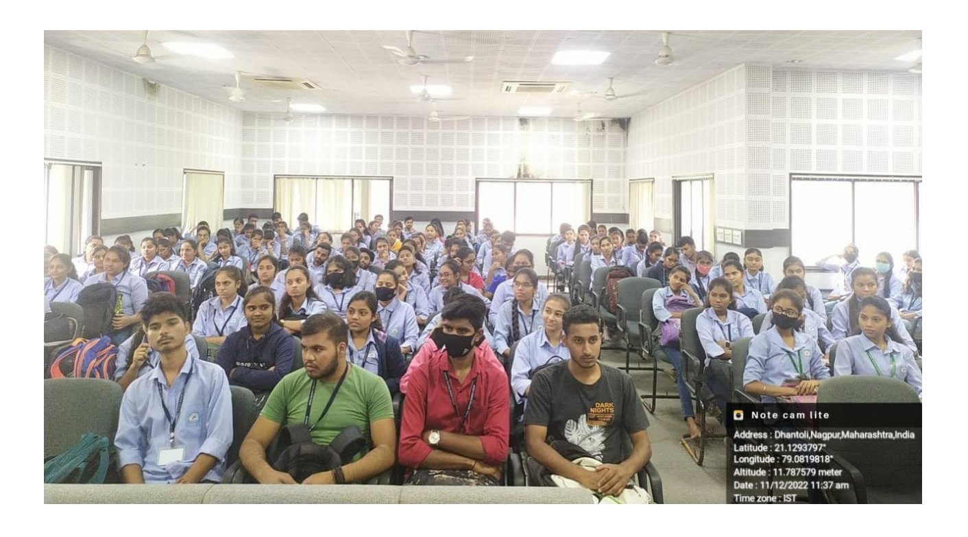
Students from Computer Science Department