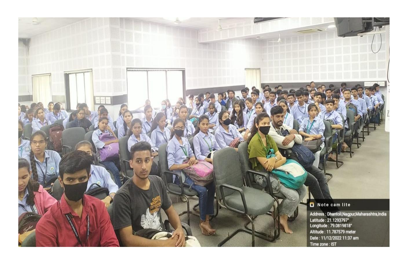
Students from Computer Science Department